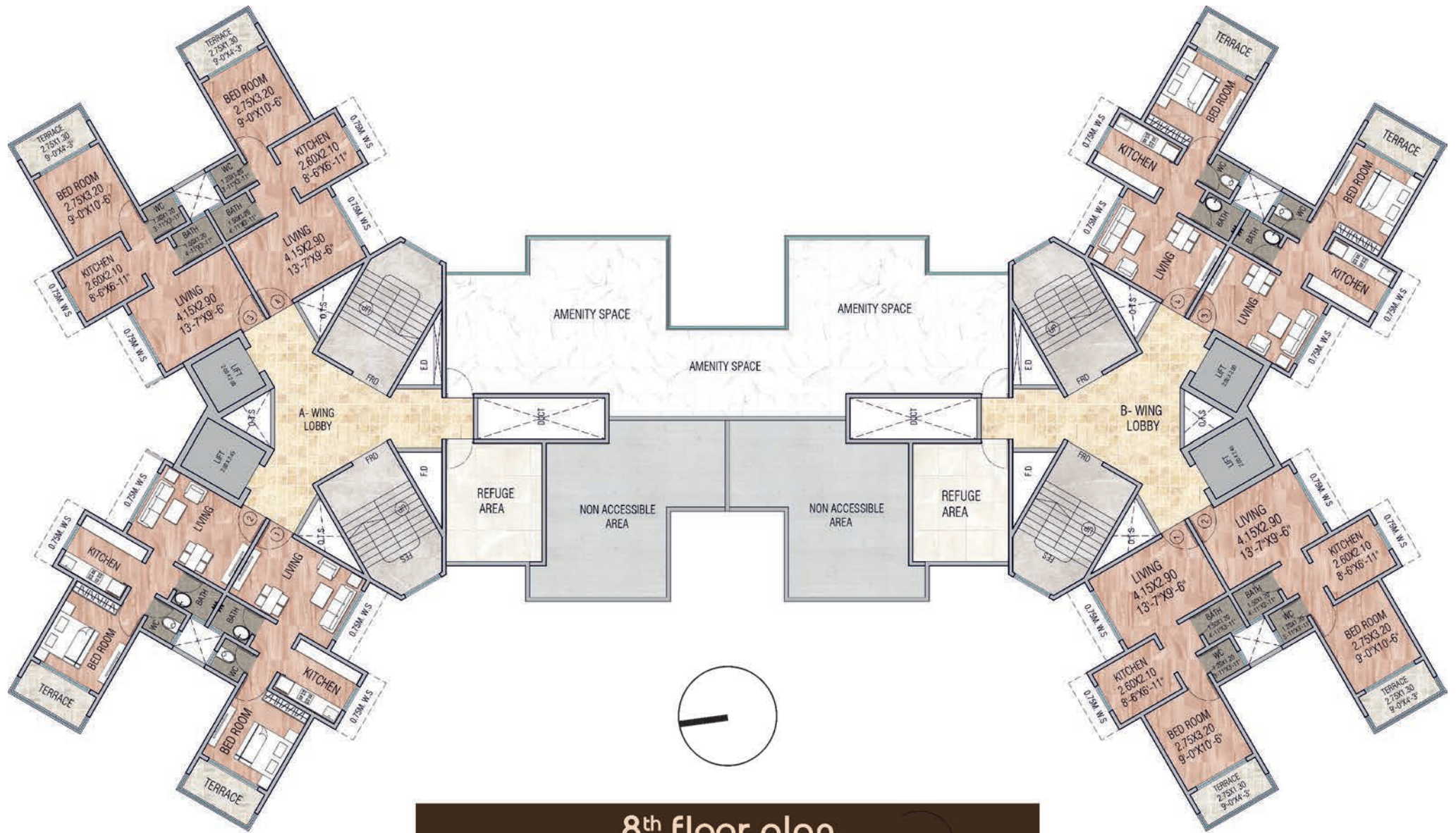
8 th floor plan