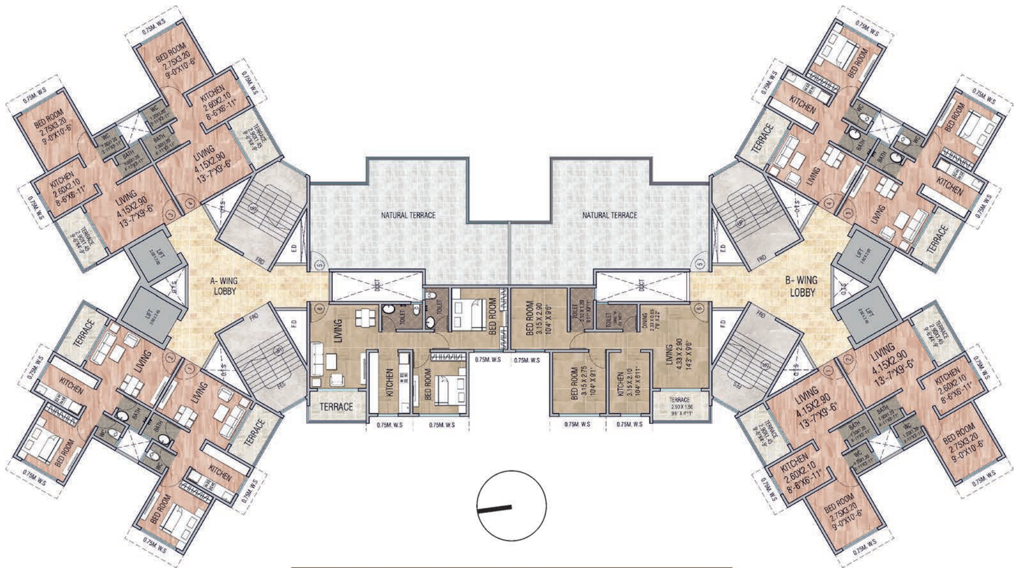
9 th floor plan