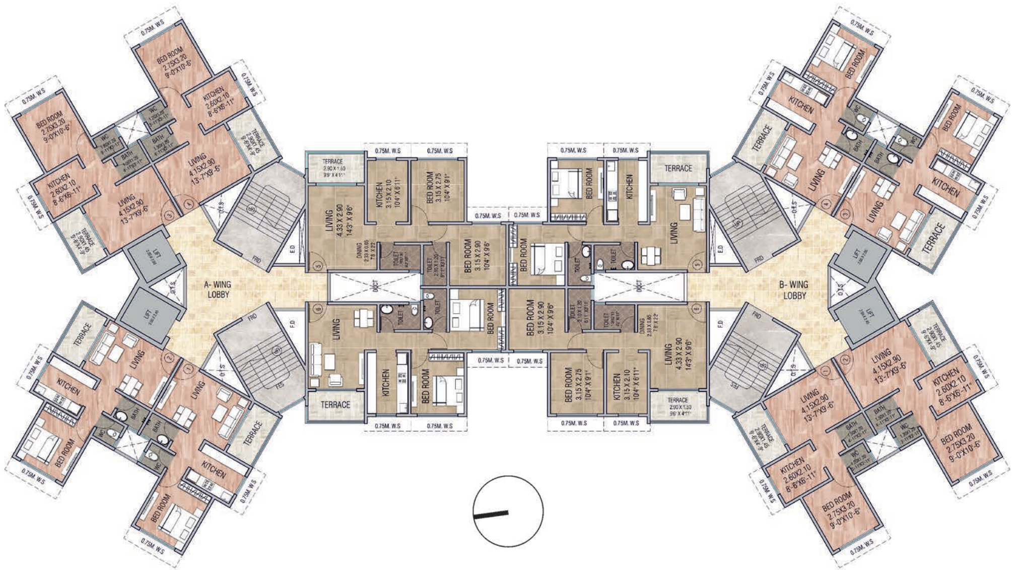
1 st , 3 rd , 5 th & 7 th floor plan